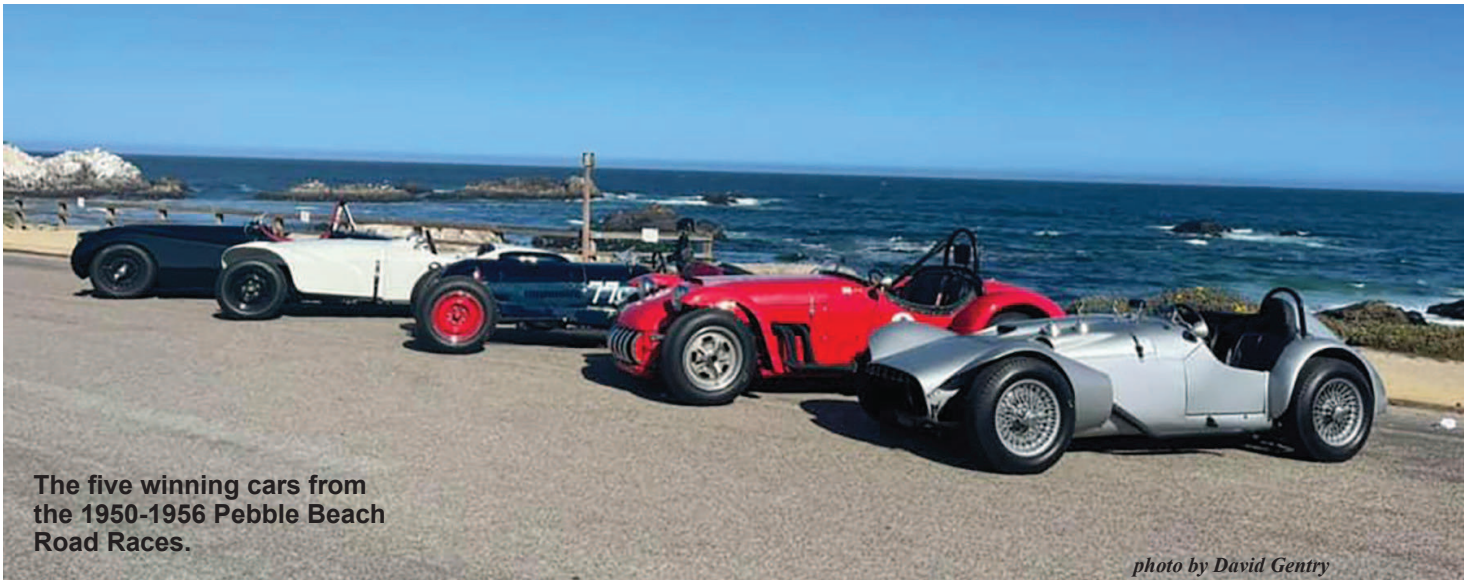
The five winning cars from the 1950-1956 Pebble Beach Road Races.